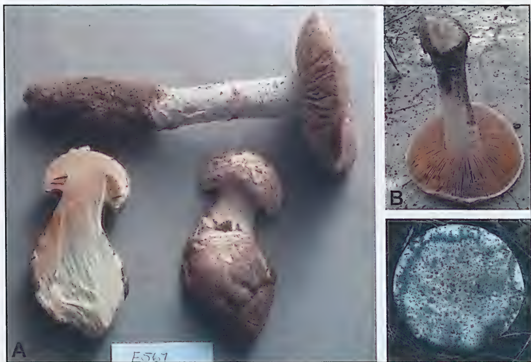
Figure 1. Amanita ochroterrea . A – showing the brownish colour of freshly exposed flesh (paratype of PERTH 07565259, O.K. Miller OKM 23747); B – Amanita ochroterrea (PERTH 08334897, B-S 168); C – surface of pileus (PERTH 08059632, E.M. & P.J.N. Davison EMD 6-2008).